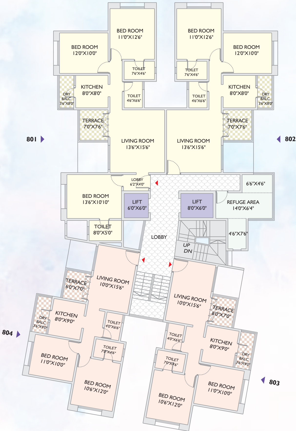
C-WING 8th FLOOR PLAN